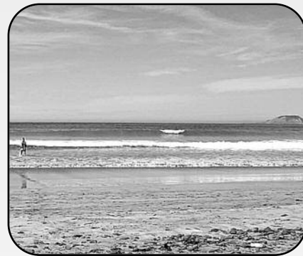
NATURAL BEAUTY: Lanzarote

Families can enjoy a camel ride on the banks of the Nile and an optional trip to Abu Simbel. In Luxor, visit the Valley of the Kings where the tombs