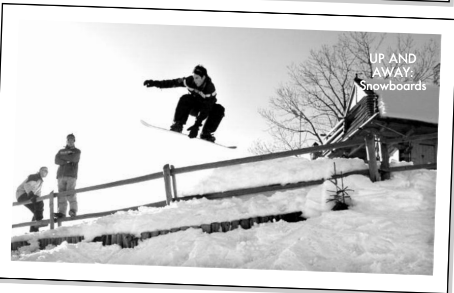
UP AND AWAY: Snowboards