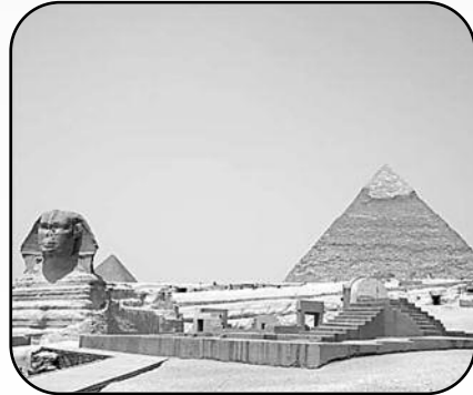
ANCIENT: Egyptian pyramids

Depart on December 23 and stay at the 4 star Hotel Deutschmann. Visit www.inghams.co.uk .